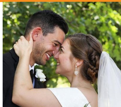
Married: September 3, 2023