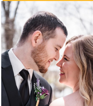
Married: March 25, 2023